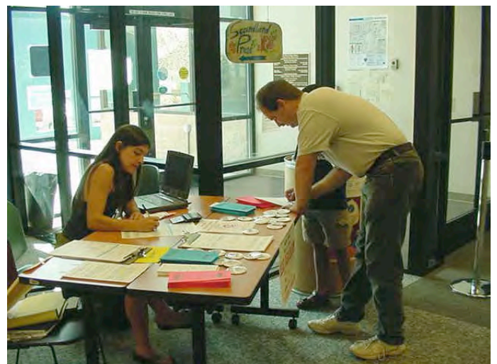
Voter registration at the Northwest Library