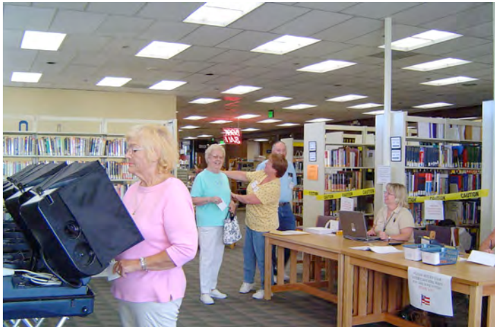
Primary early voters at the Sparks Library

These are a sampling of the comments Washoe County Library staff members heard from people who came into the public libraries for early voting. This is the first time that the libraries have been selected as early voting sites.